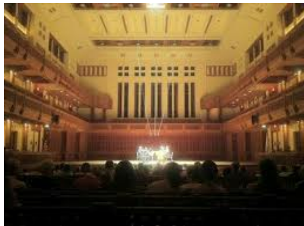
Ozawa Hall, Tanglewood