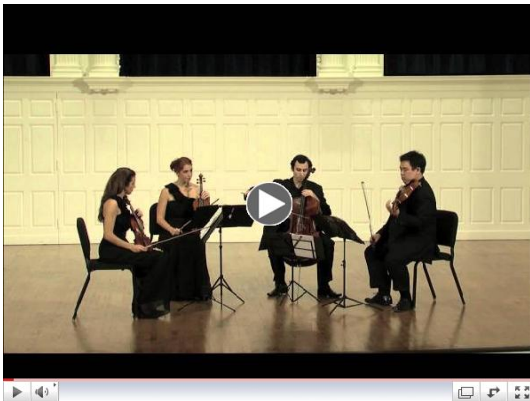
Linden Quartet: Maurice Ravel String Quartet in F Major