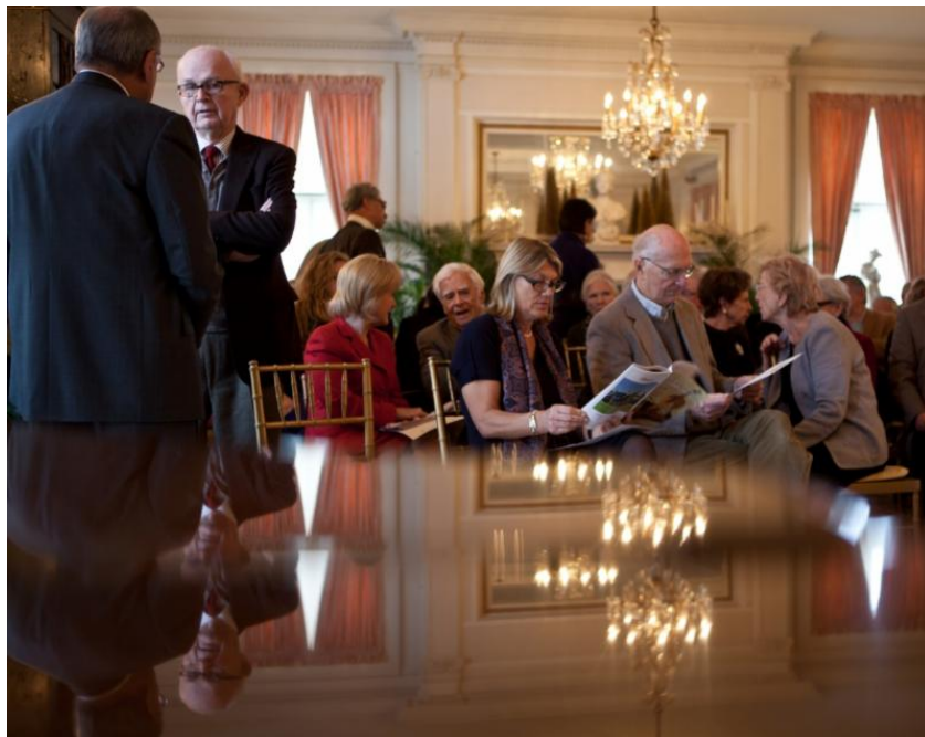
Blantyre Luncheon Musicale December 8, 2014