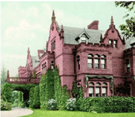
Ventfort Hall in Lenox, MA