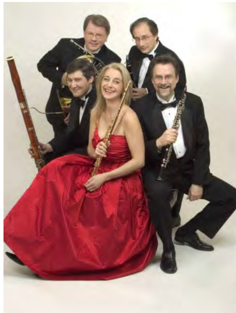
The New York Wind Quintet