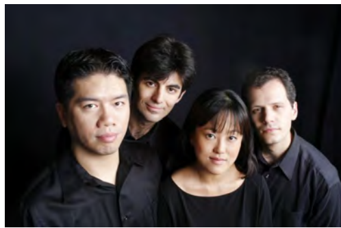
The Avalon String Quartet

on WAMC Northeast Radio, Friday mornings at 11:30.