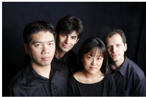
The Avalon String Quartet

on WAMC Northeast Radio, Friday mornings at 11:30.